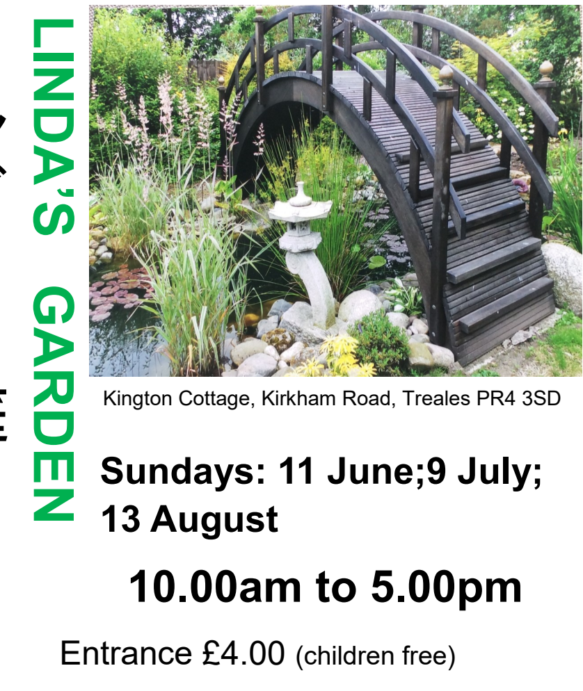
Kington Cottage, Kirkham Road, Treales PR4 3SD