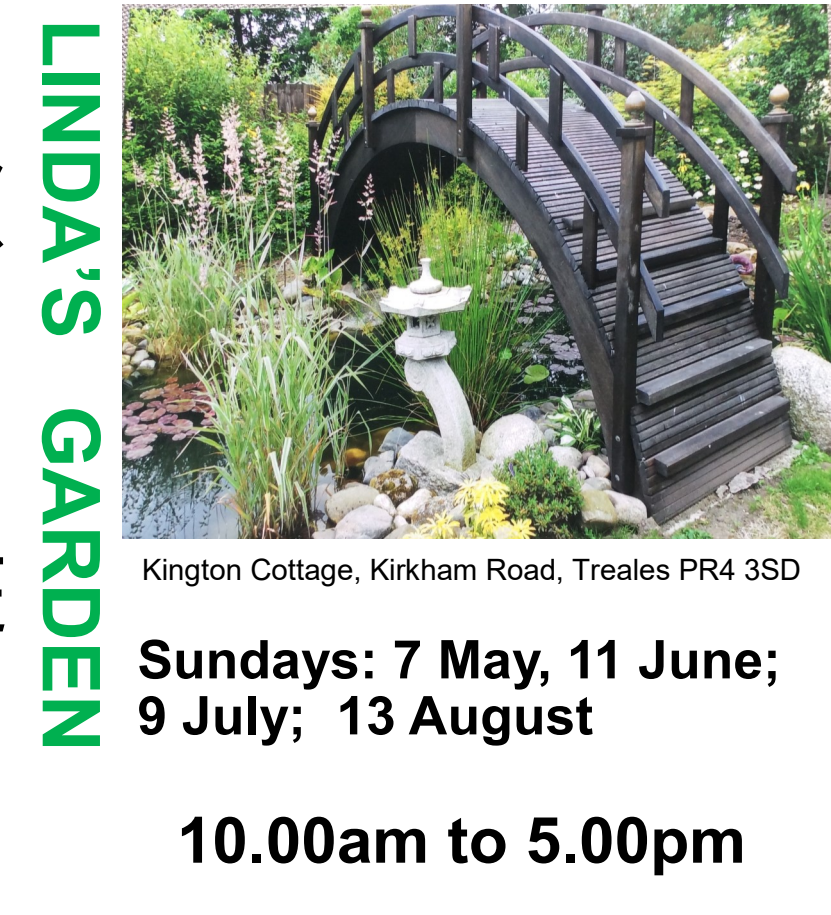
Kington Cottage, Kirkham Road, Treales PR4 3SD